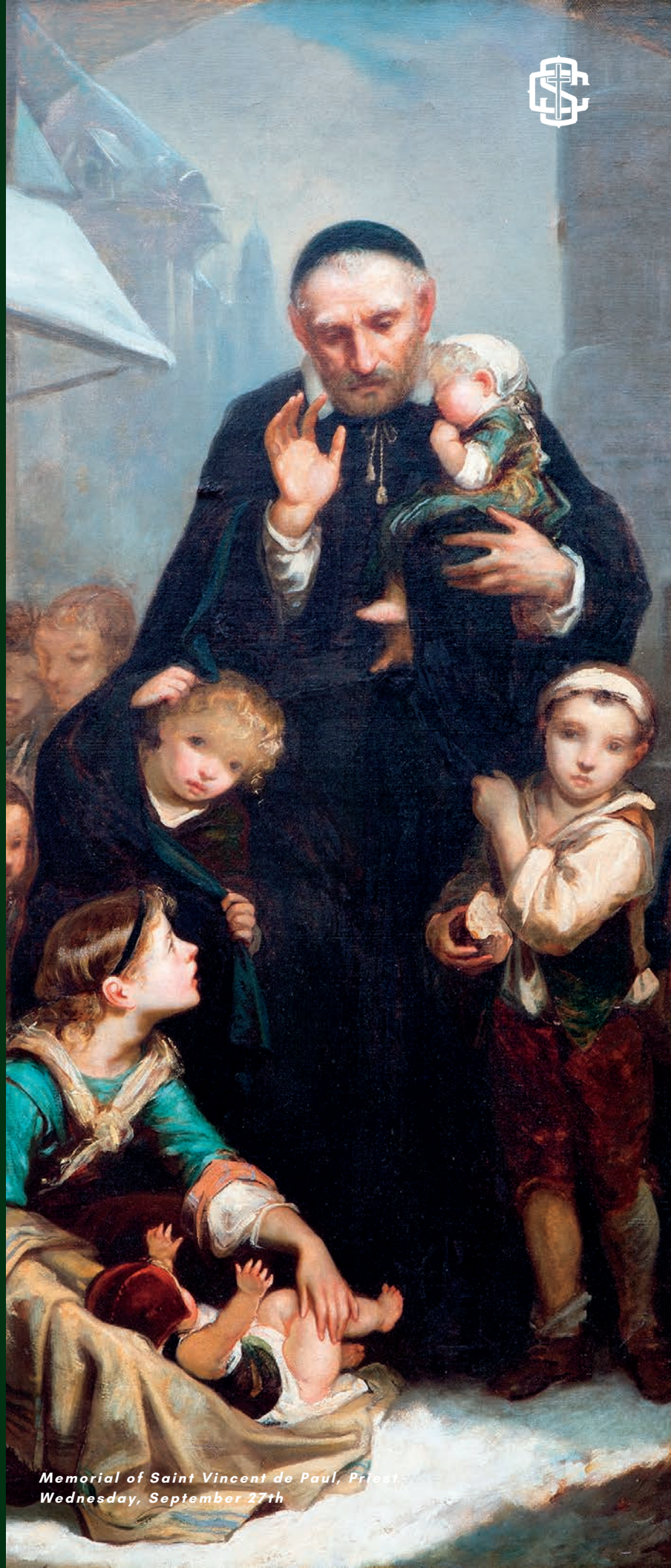
Memorial of Saint Vincent de Paul, Priest Wednesday, September 27th