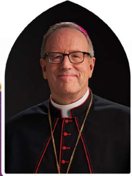
BISHOP ROBERT BARRON