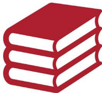
CATHOLIC EDUCATION AND FORMATION